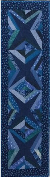
Table Runner or Placemat . . . which will it be?